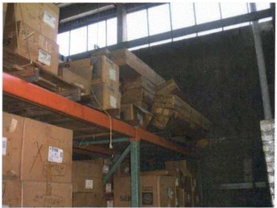
Photo 2 - Unsecured material storage on top rack, Main Storage Area/Supply room