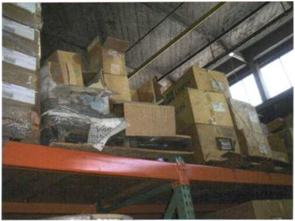
Photo 1 - Unsecured material storage on top rack, Main Storage Area/Supply room