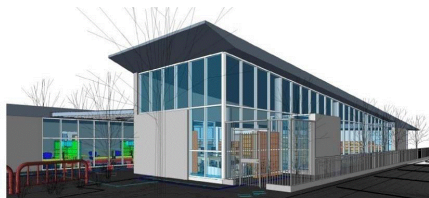
Proposed design for new Ortega Branch

The Ortega Branch will feature a large reading area, a program room with after-hours community access and distinct spaces for teens and children, including a custom Play-to-Learn area for young children and their families. Other highlights include a study room, views of the ocean, public art, and a partial living roof!