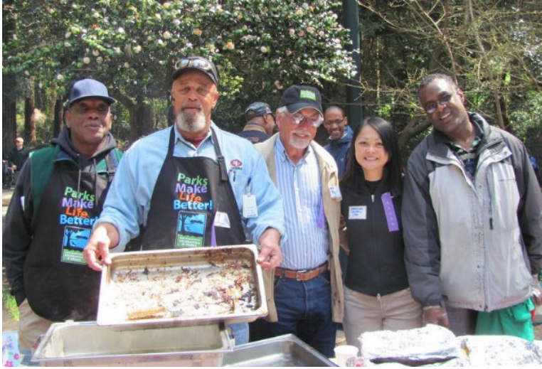
Recreation & Park Dept staff's ribs were so good, there were none left to judge!