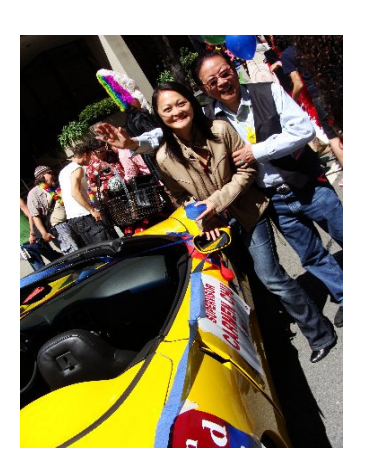
Healthy Kids Day – Stonestown YMCA