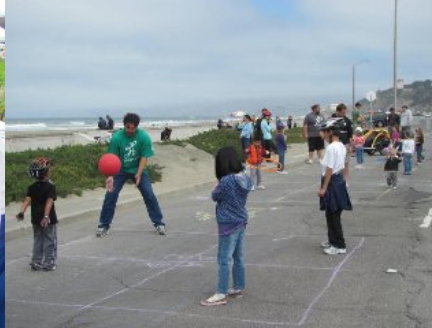
Children and families recreate along the Great Highway