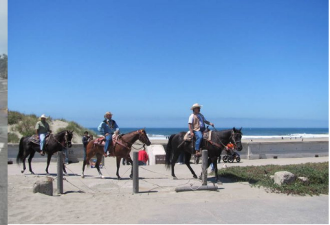
Equestrians participated in Sunday Streets!