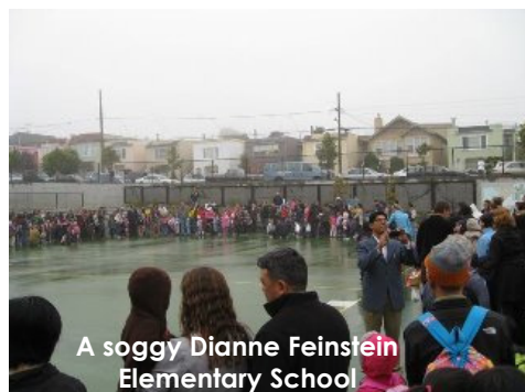
A soggy Dianne Feinstein Elementary School