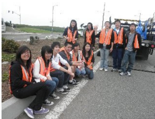
Lincoln High School's Change SF volunteer group