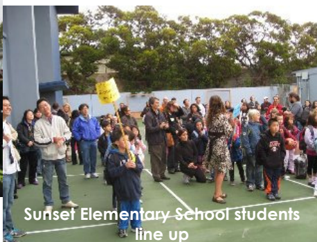
Sunset Elementary School students line up