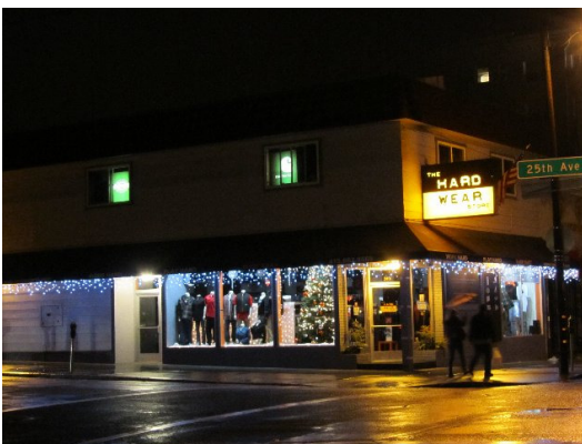
Irving Holiday Lights Project Between 19 th & 26 th Ave