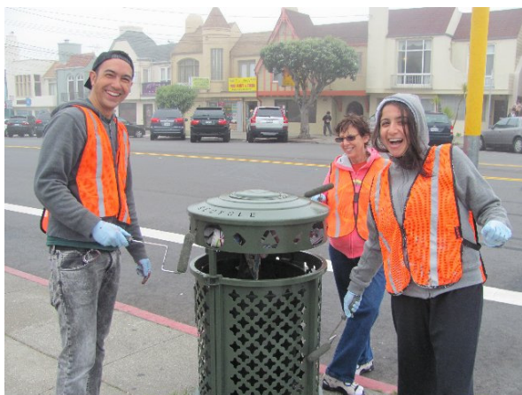
Volunteers from the SF Bahai Center paint out graffiti on Noriega.

Great job D4 residents! If you missed this opportunity, please know that as a Sunset Scavenger customer, you are entitled to a free pickup of bulky items. Please call Sunset Scavenger at 415-330-1300 for more information or to schedule your appointment.