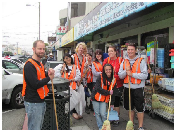
Academy of Art students sweep up Irving Street.