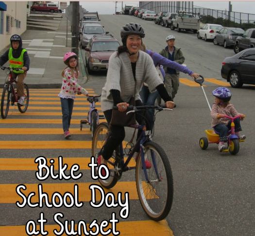
Bike to School Day at Sunset Elementary