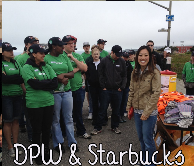
DPW & Starbucks Global Month of Service