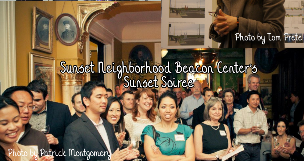
Sunset Neighborhood Beacon Center's Sunset Soiree