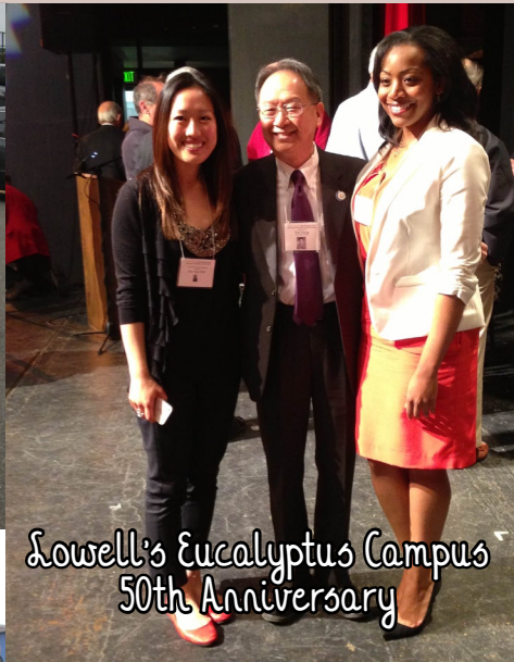
Lowell's Eucalyptus Campus 50th Anniversary