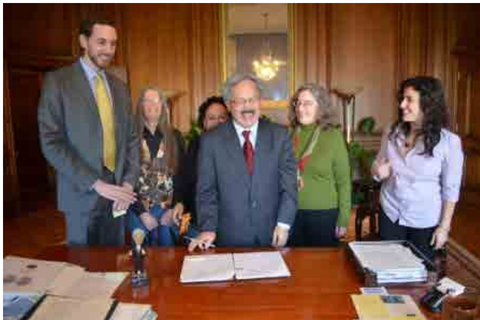
Mayor Lee signs Scott's Dogwalker Legislation into law.