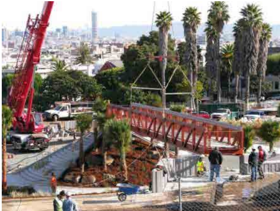
Workers install the pedestrian bridge at Helen Diller Playground