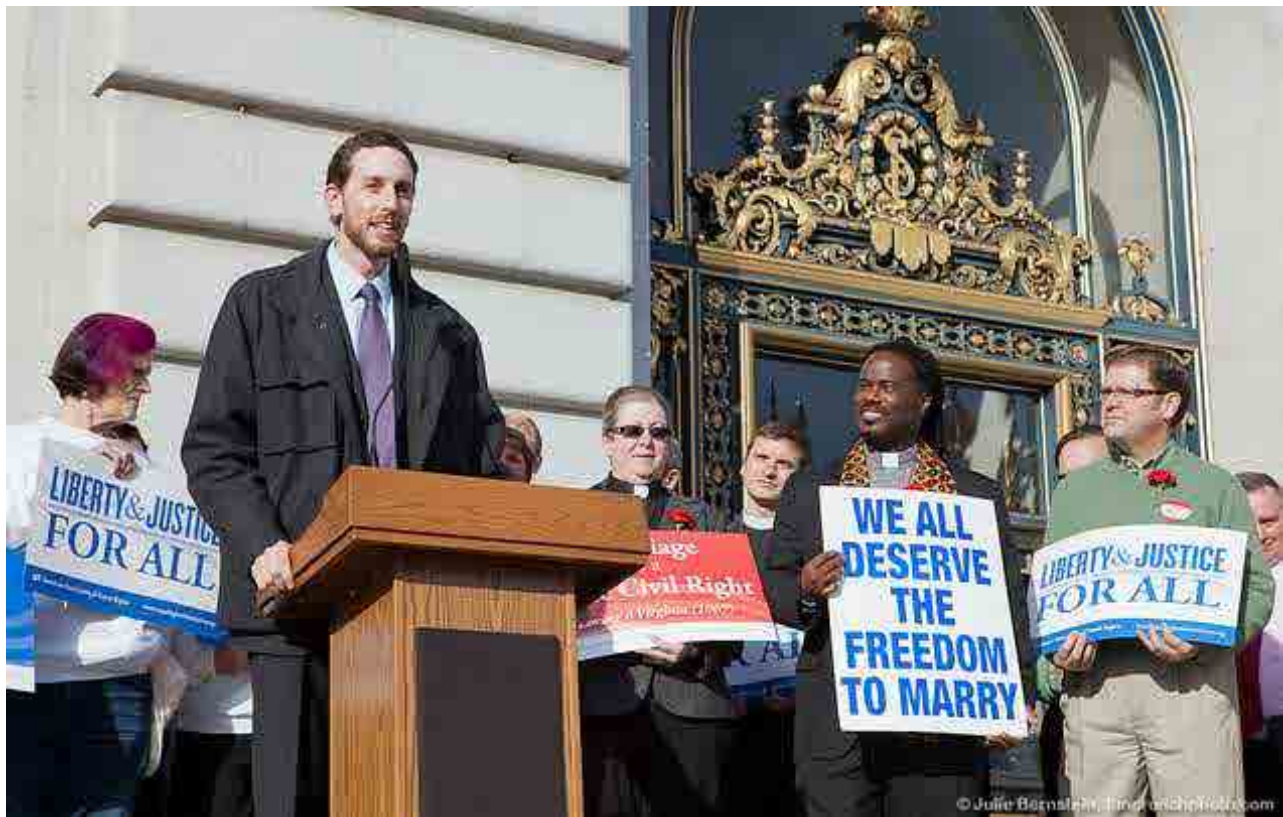
Scott speaks at a marriage equality rally on Valentine's Day