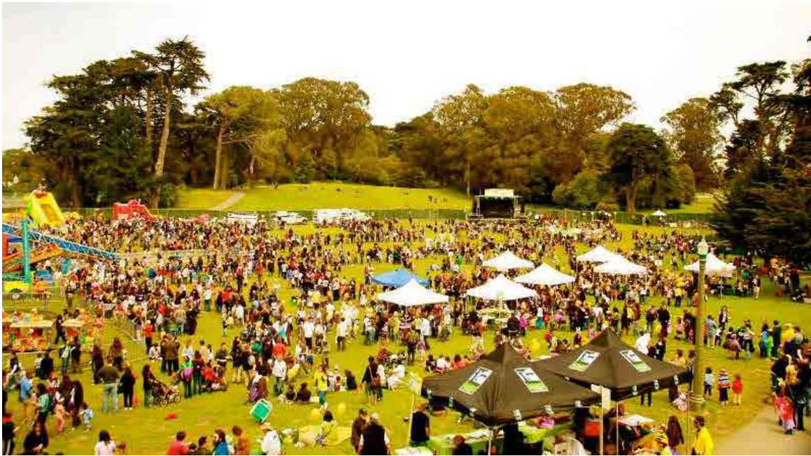
Fun abounds at Rec and Park's 2nd annual Eggstravaganza!