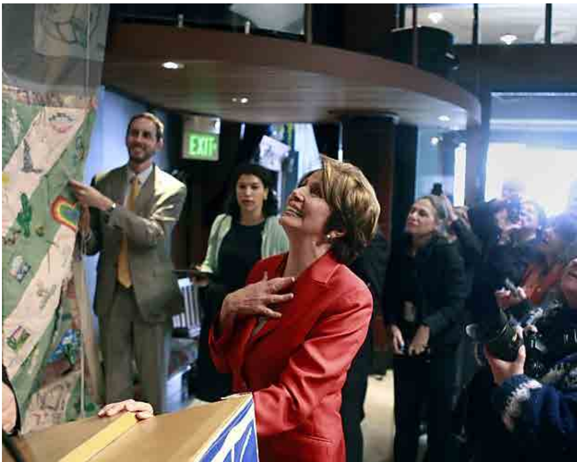
Scott and Leader Pelosi look on as a section of the NAMES Project AIDS

I recently introduced legislation to ensure that as we create historic districts, we do so in an inclusive way, one that respects the views of those living in the proposed district. The legislation also will help avoid gentrification of historic districts by ensuring that people with economic hardships are able to maintain their homes even if they cannot afford the full historic treatment. It will also ensure that the standards we apply to historic preservation in San Francisco reflect our City's unique urban setting. The legislation will be heard in committee soon and has already received the unanimous support of the Planning Commission.