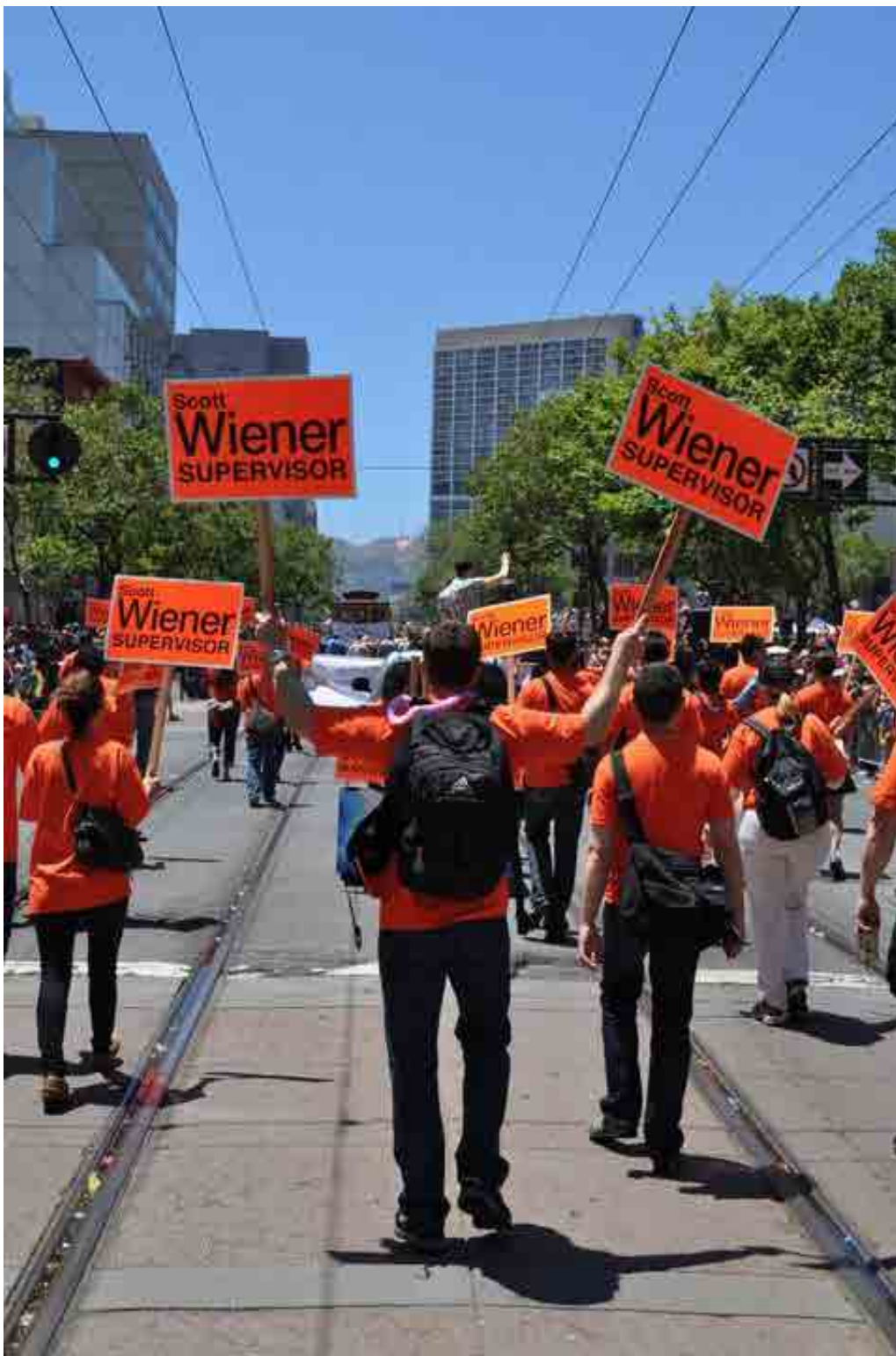
A volunteer in Scott's contingent at the 2011 Pride Parade!