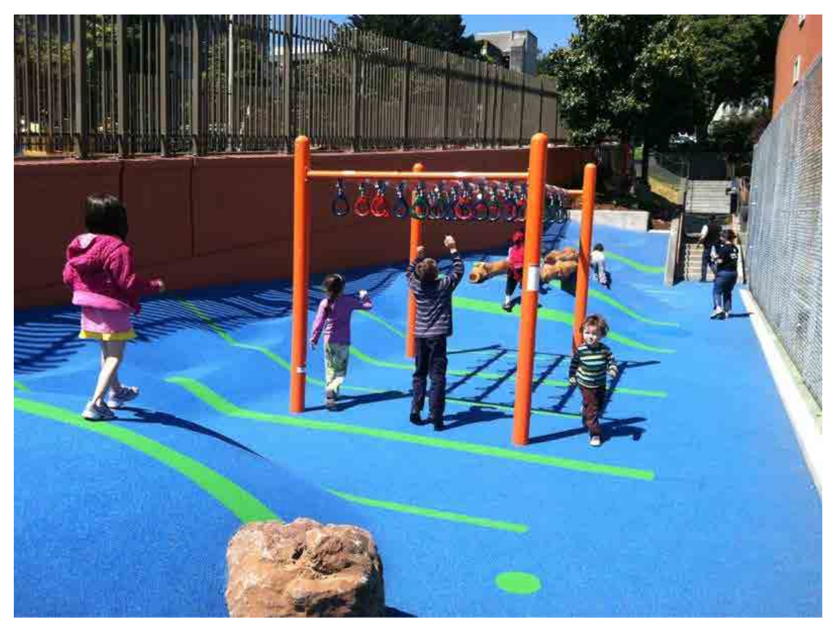
Children play at the Duboce Park Youth Play Area.

replacement of failed irrigation systems, recreation center rebuilds, and grants for community-driven projects. I look forward to working to move this critical bond forward.