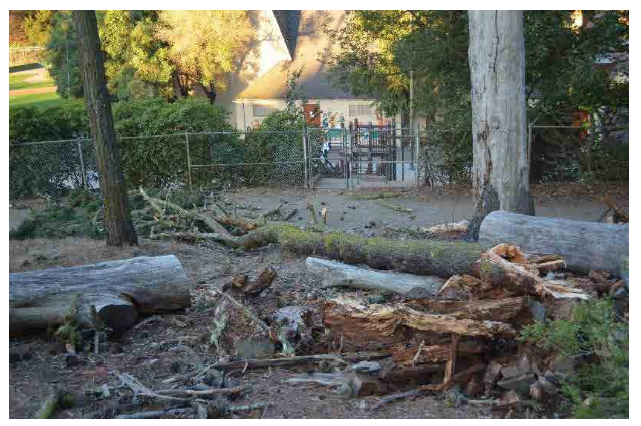
Trees that had been marked for removal fell over in Glen Canyon on October 2nd.

I will continue to work closely with the community on this and other tree issues.