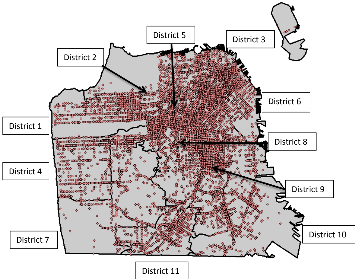
Exhibit 4: Map of DPW Graffiti Abatements, FY 2012-13