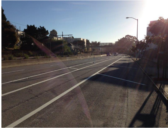
New configuration on San Jose Avenue with two traffic lanes and one bike lane

Due to the current design of San Jose Avenue, many northbound vehicles exiting Highway 280 use the street as a freeway extension and significantly exceed the 35 miles per hour posted speed limit with an average speed of 50 miles per hour adjacent to a residential neighborhood. To address this, my office worked with MTA and Cal Trans to formulate a pilot program to enhance neighborhood and bike safety and to calm traffic by having the northbound lanes mirror the existing southbound lanes. The pilot was recently implemented and will be evaluated on a timetable . The pilot removed one northbound lane of traffic (going from three lanes to two, as currently exists on the southbound side) and created a painted buffer between traffic and the bicycle lane, similar to the southbound direction. These improvements will improve conditions significantly while still allowing easy access for cars exiting 280. The trial program is in its evaluation phase and is being studied to determine whether it should be made permanent.