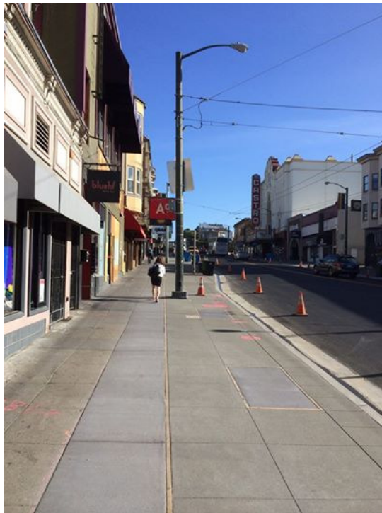
Our new wider sidewalks on Castro Street

Join me this Saturday for the Castro Street sidewalk sale. Let's support our Castro Street merchants.