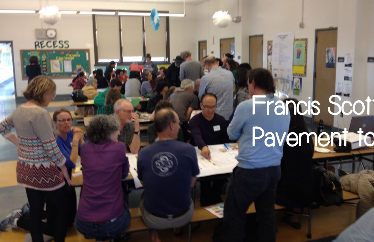
Francis Scott Key Annex Yard Pavement to Parks Meeting #2