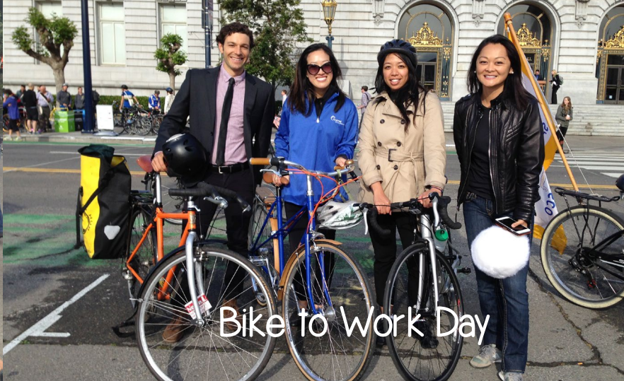
Bike to Work Day