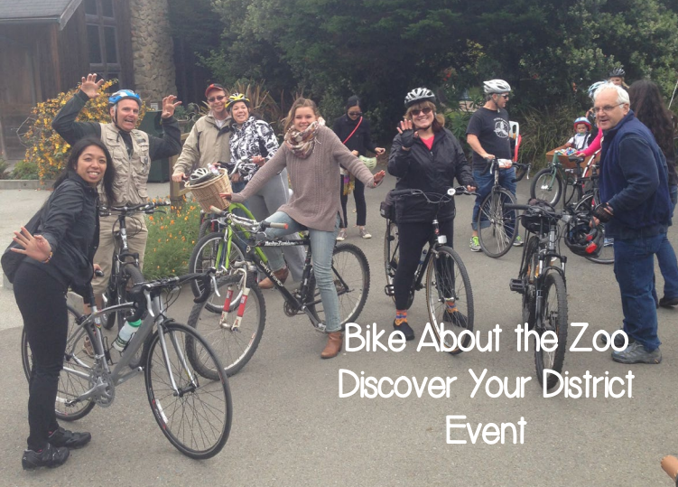
Bike About the Zoo Discover Your District Event