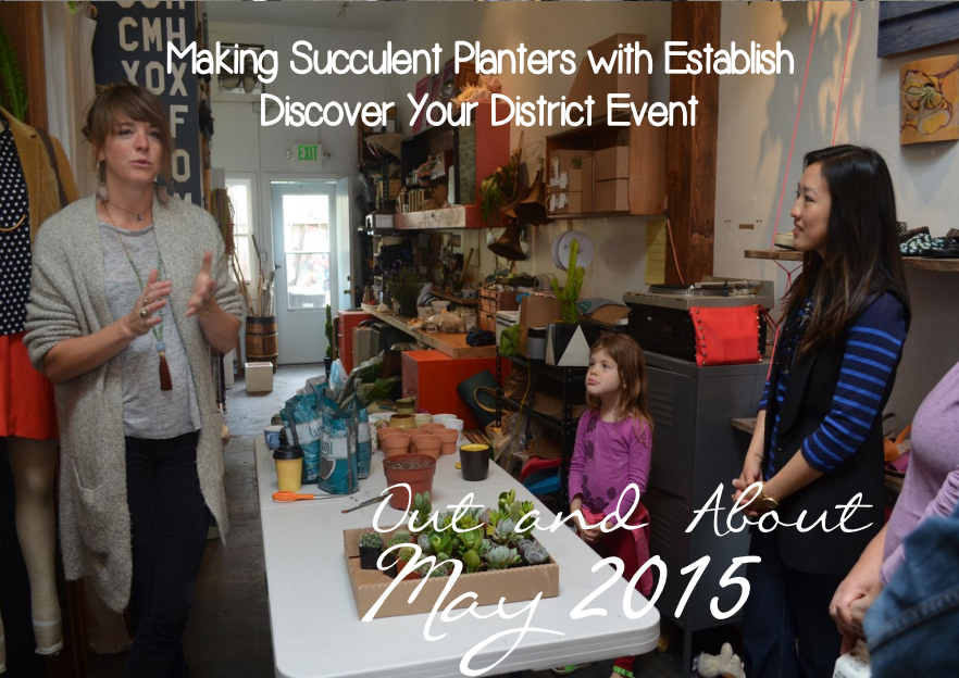
Making Succulent Planters with Establish Discover Your District Event