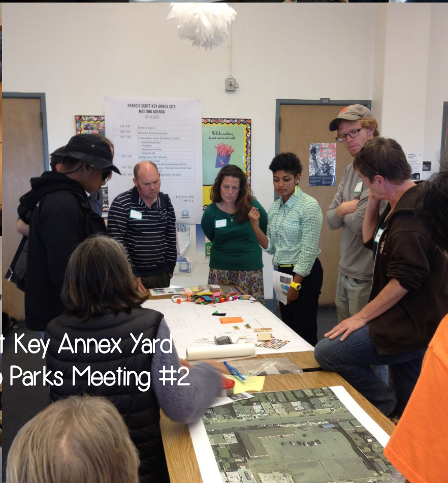
FRANCIS SCOTT KEY ANNEX SITE MEETING AGENDA 10/15/2015