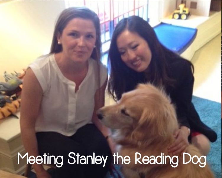
Meeting Stanley the Reading Dog