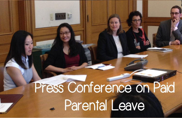
Press Conference on Paid Parental Leave