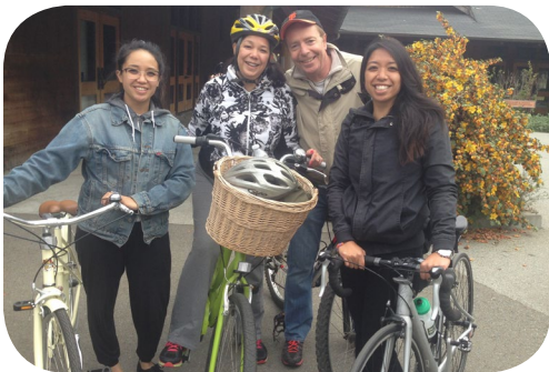
Big smiles after our Bike About the Zoo

Visit Sunset Youth Services at http://sunsetyouthservices.org/