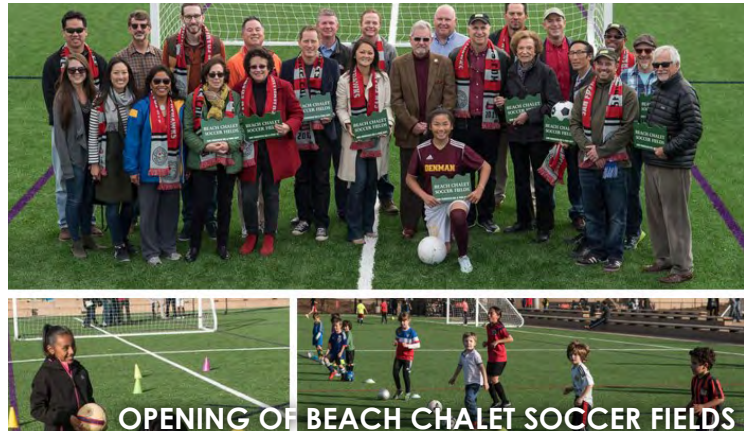
OPENING OF BEACH CHALET SOCCER FIELDS