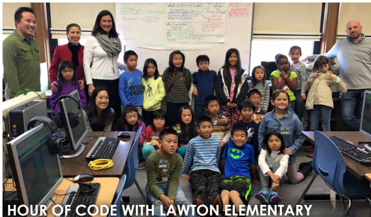
HOUR OF CODE WITH LAWTON ELEMENTARY