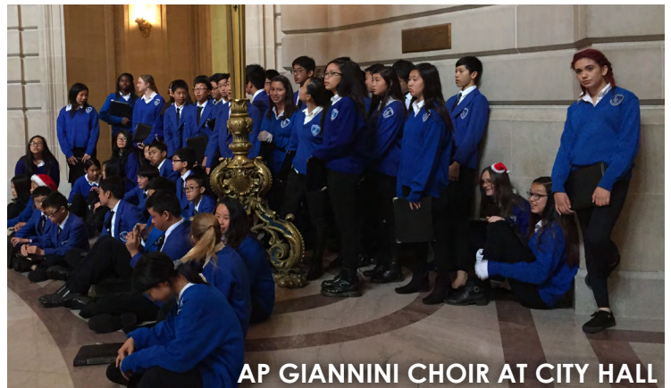
AP GIANNINI CHOIR AT CITY HALL