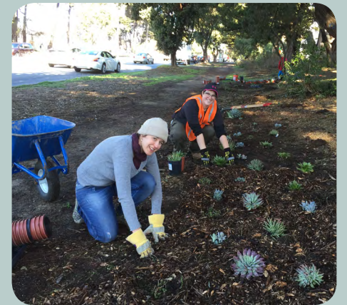
Volunteers plant drought tolerant succulents to beautify Sunset Boulevard