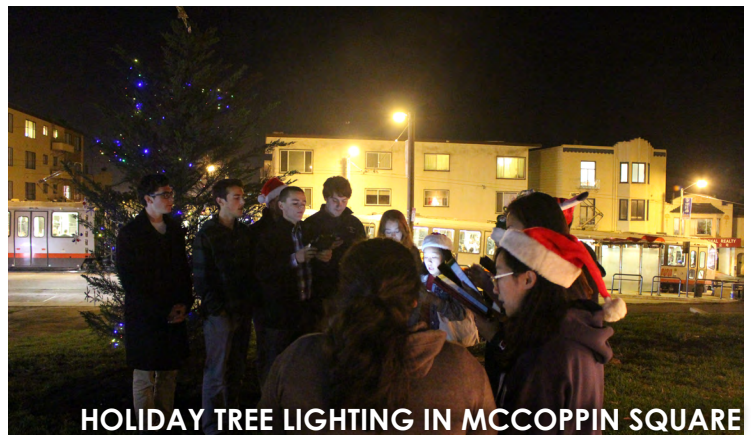
HOLIDAY TREE LIGHTING IN MCCOPPIN SQUARE