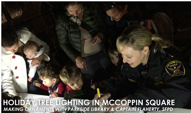
HOLIDAY TREE LIGHTING IN MCCOPPIN SQUARE MAKING ORNAMENTS WITH PARKSIDE LIBRARY & CAPTAIN FLAHERTY, SFPD