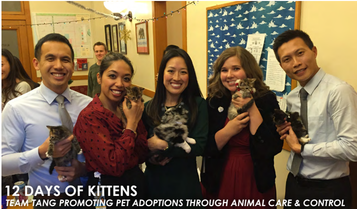
12 DAYS OF KITTENS TEAM TANG PROMOTING PET ADOPTIONS THROUGH ANIMAL CARE & CONTROL