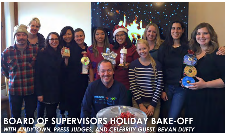
BOARD OF SUPERVISORS HOLIDAY BAKE-OFF WITH ANDYTOWN, PRESS JUDGES, AND CELEBRITY GUEST, BEVAN DUFTY