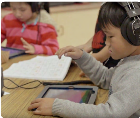
Ulloa Elementary student using digital device.

SparkLearning is a citywide campaign to raise funds to bring new technology to all of our schools and help integrate digital devices into classrooms to support learning. Early this year, our office joined SFUSD in launching the SparkLearning campaign in the Sunset District. As one of the pilot schools, Ulloa Elementary School has launched its crowdfunding web page to connect with a tech partner and raise awareness about the significance of investing in technology for schools.