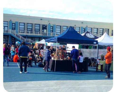
Holiday Mercantile at Francis Scott Key.

To show your support for local artists and businesses or participate in future pop-up events in our neighborhood, please contact Sunset Mercantile at www.sunsetmercantilesf.com/contact.html .