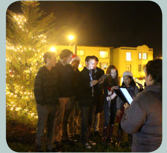
The Saint Ignatius choir entertains Sunset neighbors with holiday carols

On December 4th, over 50 Sunset and Parkside neighbors came out to join us for the 3rd Annual lighting of the holiday tree in McCoppin Square. Neighbors made tree ornaments with the Parkside Branch Library to hang on our newly replanted tree, and were entertained with carols by the Saint Ignatius Choir. This event was made possible by our friends and merchants from the People of Parkside Sunset (POPS), the Recreation and Parks Department, and neighbors like you!