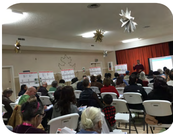
L-Taraval Rapid Meeting on December 14

On December 14, the San Francisco Municipal Transportation Agency (SFMTA) hosted its second L-Taraval Rapid Project open house at Grace Lutheran Church to get feedback and input from Muni riders, residents, and merchants. SFMTA provided a community presentation to reiterate the project goals of improving public safety, transit reliability, and maintenance along the L-Taraval line. Residents gave feedback on proposed elements such as boarding islands, stop removals and transit-only lanes. We heard great feedback at this meeting, and look forward to hearing more before SFMTA enters the design phase for this project.