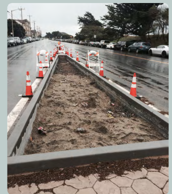
New Median Island at Great Highway

In addition to enhancing pedestrian safety in the area, our office would also like to take this opportunity to beautify the area by landscaping the median island. Please let us know if you are interested in volunteering to help maintain the landscaping in the median. If you would like to volunteer, please contact our office at (415) 554-7460 or email Katy.Tang@sfgov.org .