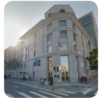
San Francisco Superior Court (400 McAllister Street)

Dedicated San Franciscans who want to make a difference in the city are welcomed to apply for the Civil Grand Jury 2016-2017 term. The Civil Grand Jury provides a “watchdog” role to ensure the continuous devotion of City departments, agencies and officials. Participants are given the opportunity to help communities around San Francisco by presenting issues to the Superior Court to initiate change. Being independent from government selected officials, the Civil Grand Jury opt for their own topics for inquiry. Civil Grand Jury members will have the opportunity to review records and financial documents; interview City and County department heads, elected officials, and staff; and visit government facilities to formulate reports and recommendations. Reports that affect City departments or officials contain recommendations that must also be responded to. Those who enjoy learning about City government, researching, writing, editing, analyzing data, or meeting people committed to making San Francisco a better place to live are strongly encouraged to apply.