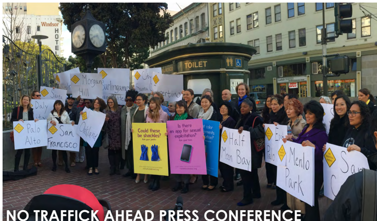
NO TRAFFICK AHEAD PRESS CONFERENCE