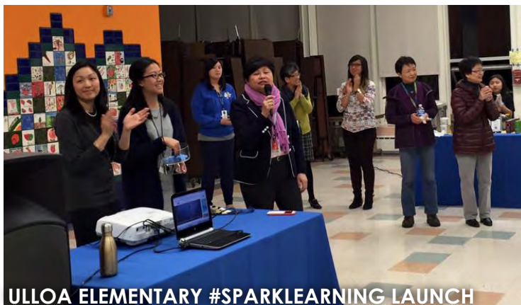
ULLOA ELEMENTARY #SPARKLEARNING LAUNCH