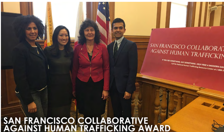
SAN FRANCISCO COLLABORATIVE AGAINST HUMAN TRAFFICKING AWARD