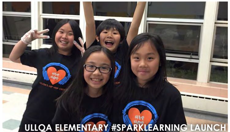
ULLOA ELEMENTARY #SPARKLEARNING LAUNCH