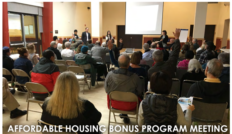
AFFORDABLE HOUSING BONUS PROGRAM MEETING