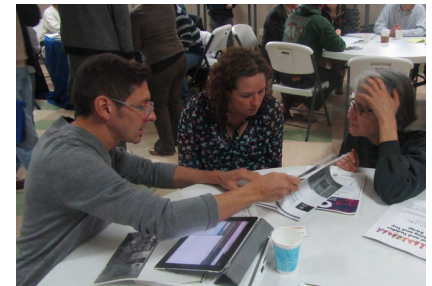
DBI/PIC staff come out to the Sunset and resolve resident's questions about permits and requirements

That is why in partnership with the Department of Building Inspection (DBI) and Planning Department's Planning Information Counter (PIC), we will be hosting our 3rd annual DBI/PIC mobile workshop this year to help Sunset residents easily meet with a DBI/PIC professional to get their questions answered.