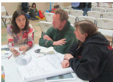
Setting up one-on-one meetings with DBI/PIC staff give residents an opportunity to discuss specific questions or issues

The DBI/PIC workshop will be held on Saturday, February 20th from 10am-12pm at Grace Lutheran Church (3201 Ulloa Street at 33rd Avenue) . This workshop will consist of a short presentation, followed by a general question and answer session, and one-on-one meetings with a planner from the PIC and/or DBI staff to discuss your individual questions.