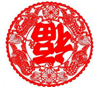
Chinese character FÚ (福) meaning "prosperity" or "good luck": Often displayed upside-down as word play to mean "good luck arrives."

Chinese New Year is a time for families and friends to get together to share wishes for luck and prosperity in the coming year. There are many celebrations and rituals during this time, including spiritual ceremonies, paying respect to ancestors, and house cleaning. On this occasion, my office extends to you our warmest greetings, wishing you a happy and prosperous Year of the Monkey!