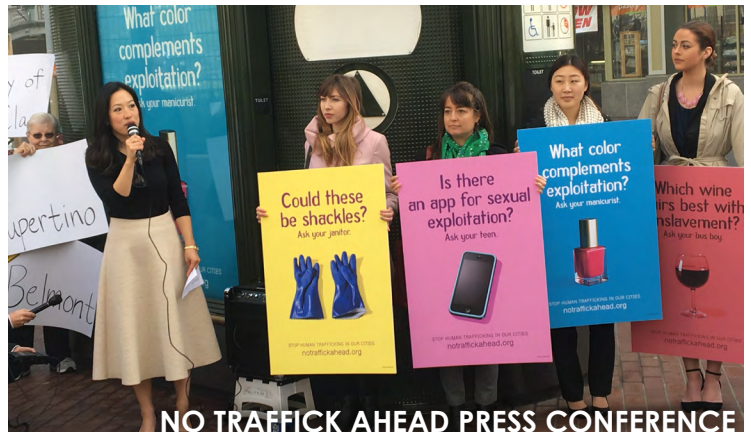
NO TRAFFICK AHEAD PRESS CONFERENCE