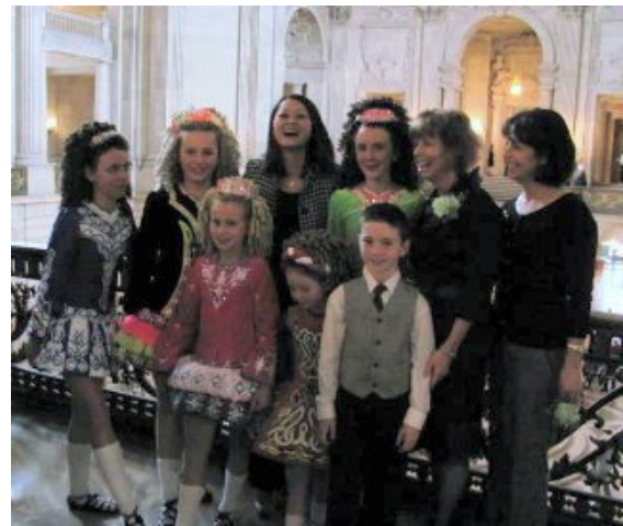
Dancers from the Whelan School of Irish Dance at City Hall after the flag raising ceremony