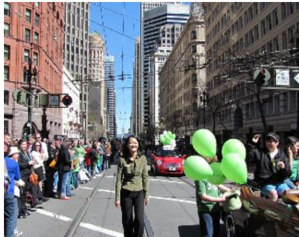
Annual St. Patrick's Day Parade on May 13 th