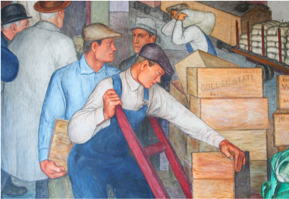
Historic Coit Tower Murals