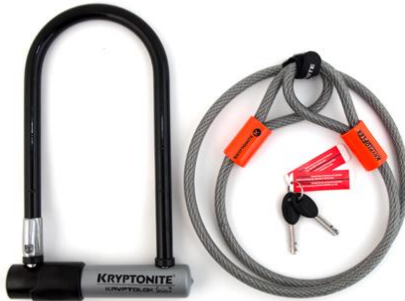
Exhibit 9: Common Bicycle Locks

According to the DOJ's Center for Problem-Oriented Policing, a lock is considered secure if it can withstand an attack of three minutes or more by a thief using readily available hand tools. U-locks are widely considered to be the most secure lock to use to prevent bicycle theft because cable locks, depending on the individual lock's quality, are typically easy for thieves to cut using simple wire cutters. It is often recommended to use more than one type of lock, like both a u-lock and a cable lock, to make theft more difficult. Second, the locks used must be secured to an appropriate stationary object, such as a bicycle rack, in such a way that makes the bicycle more difficult to steal. Of the 180 possible locking configurations to secure a bicycle using a standard u-lock, only 23 are considered secure while 109 of those configurations are considered poor and 48 are considered semi-secure. Failure to lock a bicycle with the right lock and in the right way may result in that bicycle being stolen. Exhibit 10 below illustrates two proper bicycle-locking techniques.