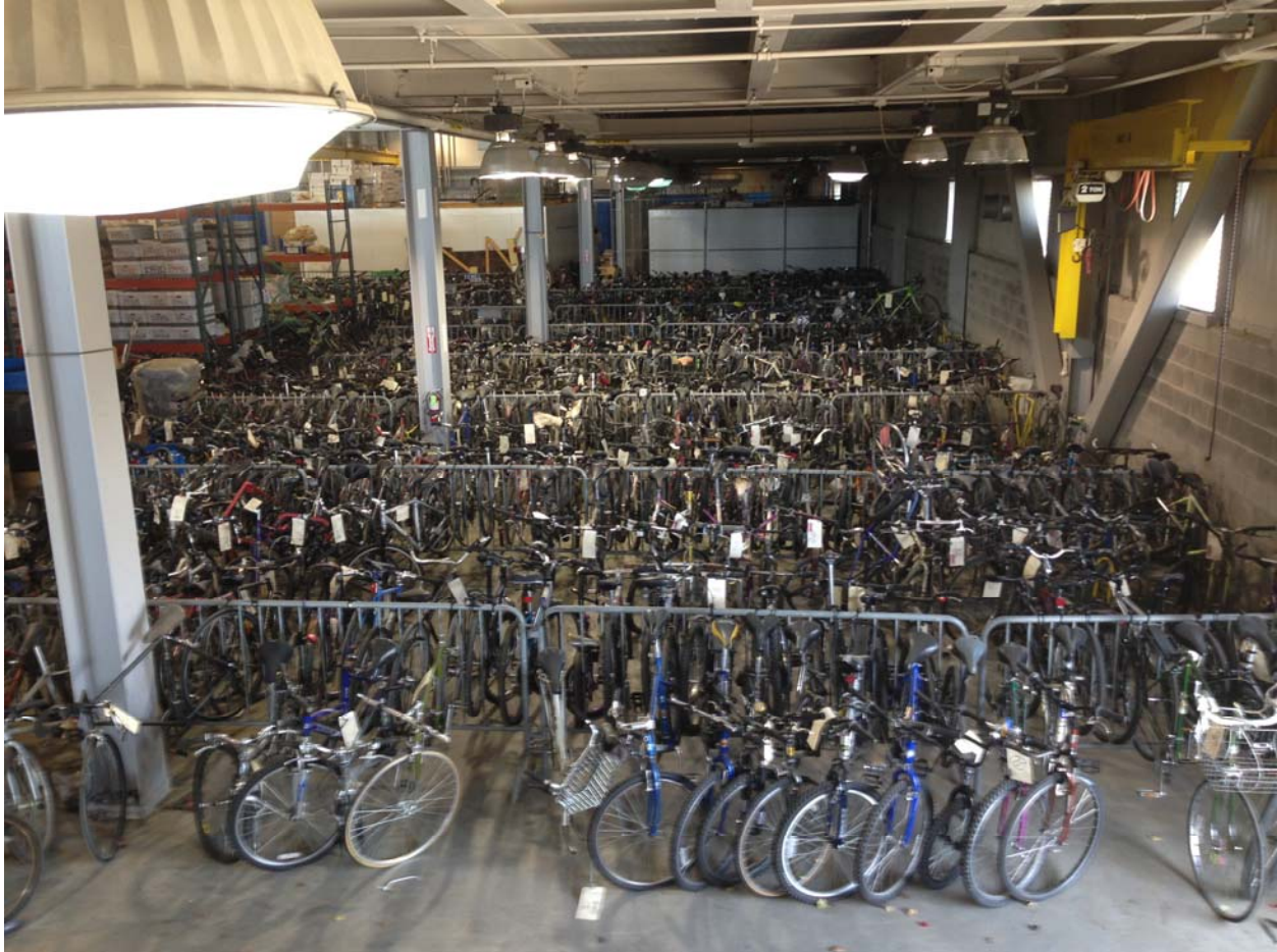
Exhibit 7: Bicycles in SFPD Custody at Building 606, March 20, 2013

Like the process of booking bicycles, the process of releasing bicycles varies by the bicycles' SFPD property classification.