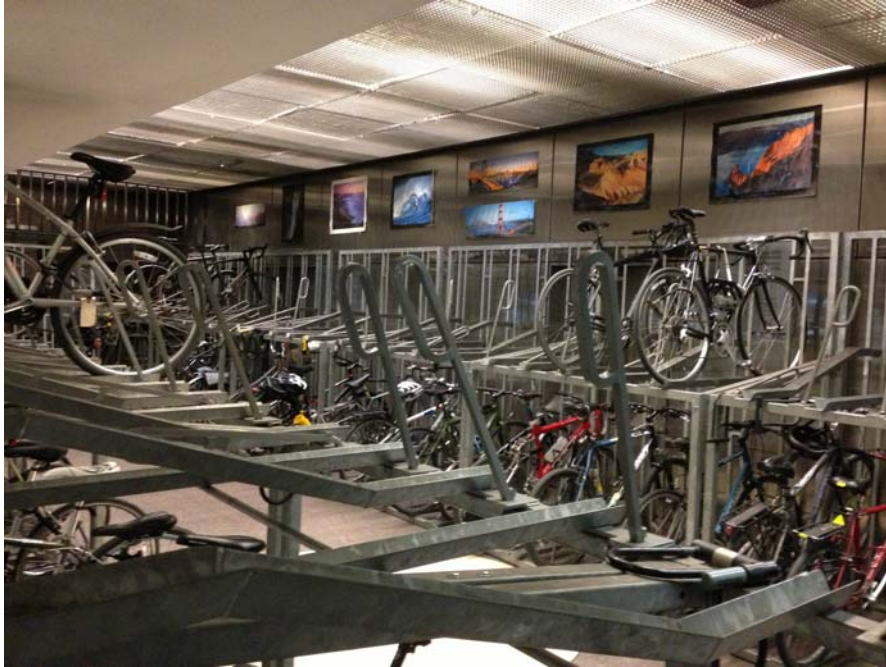
Exhibit 11: Bicycle Parking Cage, Embarcadero BART Station

BART is in the process of implementing its Bicycle Plan, issued in July, 2012. Included in the BART Bicycle Plan's goals is to increase bicycle parking of all types to encourage BART passengers to bicycle to stations and to deter bicycle theft by improving lighting in bicycle parking areas and by increasing bicycle parking availability. BART plans to add two additional bicycle parking stations in two San Francisco stations, the 24 th Street Mission and Civic Center stations, by 2014. The Civic Center bicycle station will be outside the paid area of the BART station and therefore accessible by both BART and MUNI riders. BART also plans to track bicycle theft data more closely to facilitate the development of measures to combat theft.