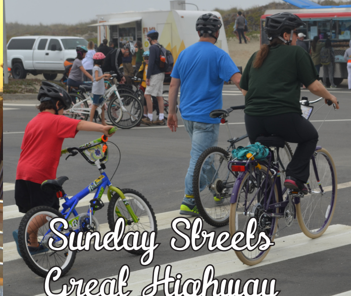
Sunday Streets Great Highway