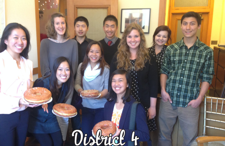
District 4 Summer Intern Social