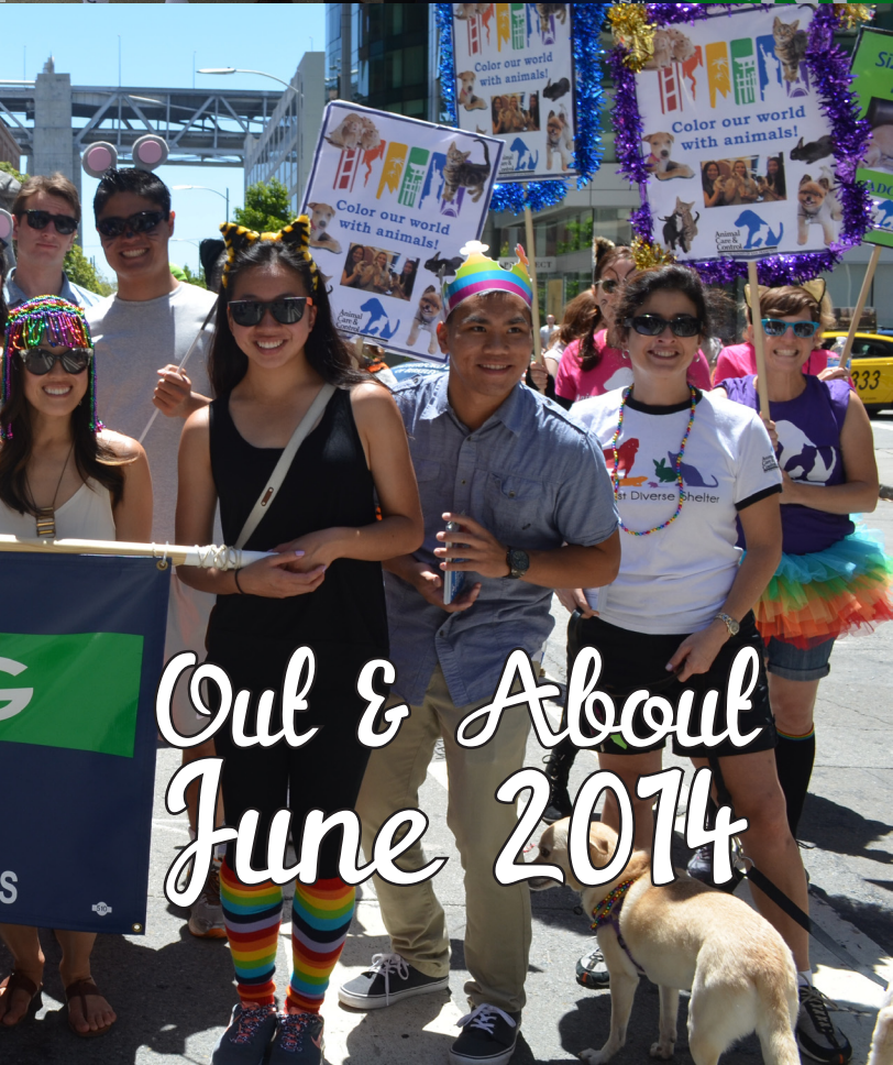
Out & About June 2014