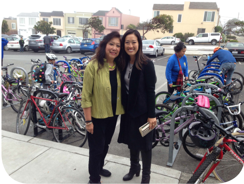
Learning Bicycle Safety at Sunset Elementary

Visit Andytown Coffee Roasters at www.andytownsf.com