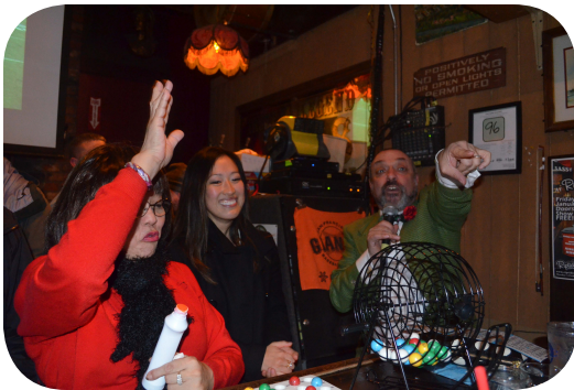
BINGO at the Riptide!

Sarah Pascual Yoga at http://www.sarahpascualyoga.com/