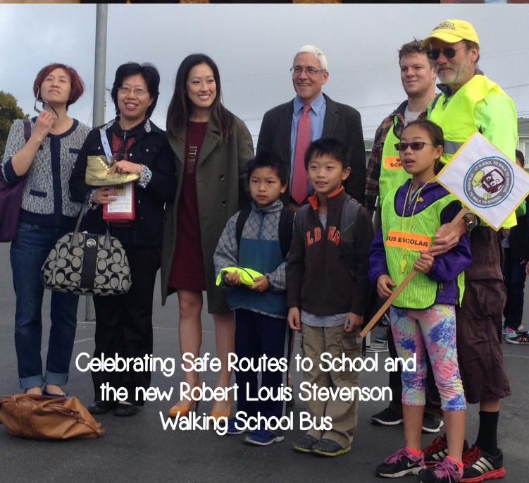
Celebrating Safe Routes to School and the new Robert Louis Stevenson Walking School Bus