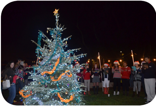
Lighting the holiday tree at McCoppin Square

Visit the SF Zoo at http://www.sfzoo.org/learn/family-programs.htm