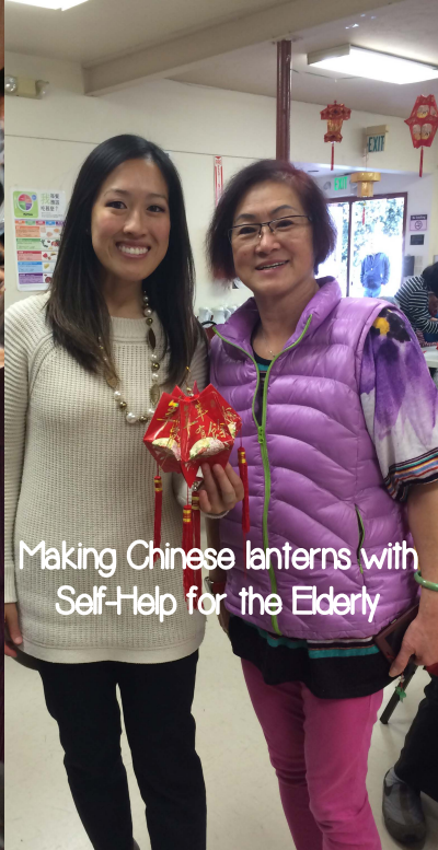
Making Chinese lanterns with Self-Help for the Elderly