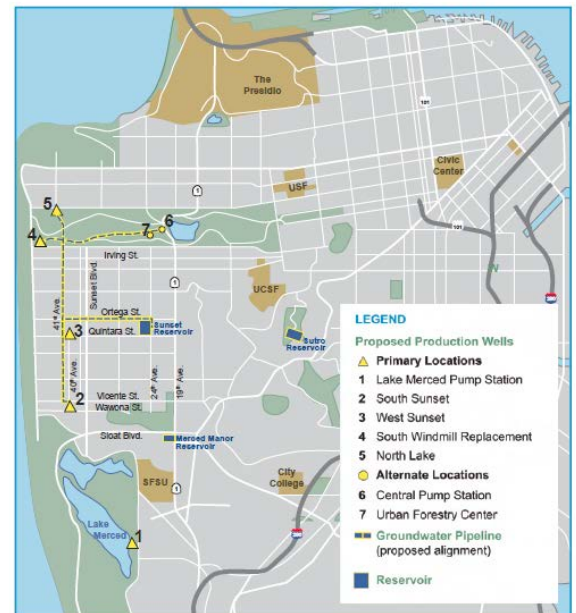
This map shows the proposed project facilities including wells and pipelines.