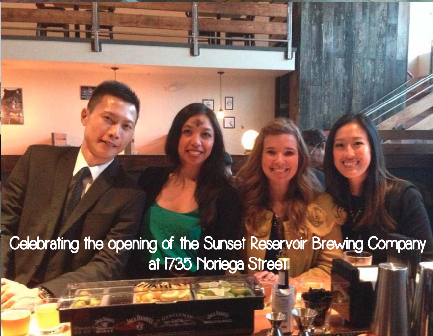
Celebrating the opening of the Sunset Reservoir Brewing Company at 1735 Noriega Street