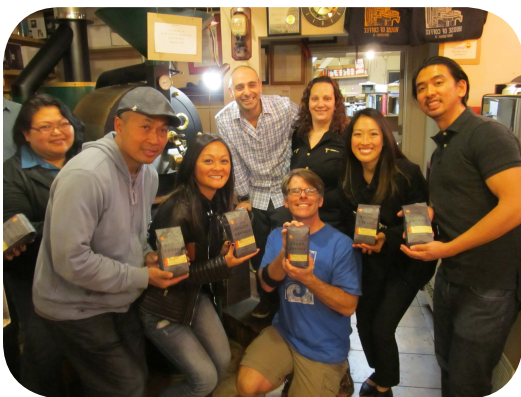
Roasting coffee with Henry’s House of Coffee

Visit San Franpsycho at www.sanfranpsycho.com