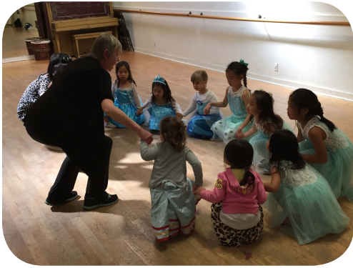
Dancing to "Frozen" at Sunset Movement Arts

We have enjoyed meeting many residents through our Discover Your District (DYD) events! We received great feedback from participants that they were able to learn new skills and visit small businesses they had never visited before. We are currently registering residents for our next series of DYD events – from soda bread-making lessons to getting a behind-the-scenes biking tour with the San Francisco Zoo. Be sure to register for these events early! Find all DYD events at www.sfbos.org/DiscoverYourDistrict .