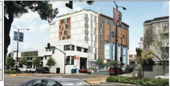
1296 Shotwell, District 9