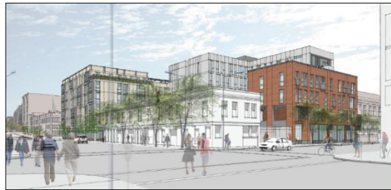
735 Davis, District 3