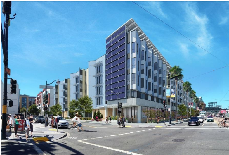
Edwin M. Lee Apartments, District 6