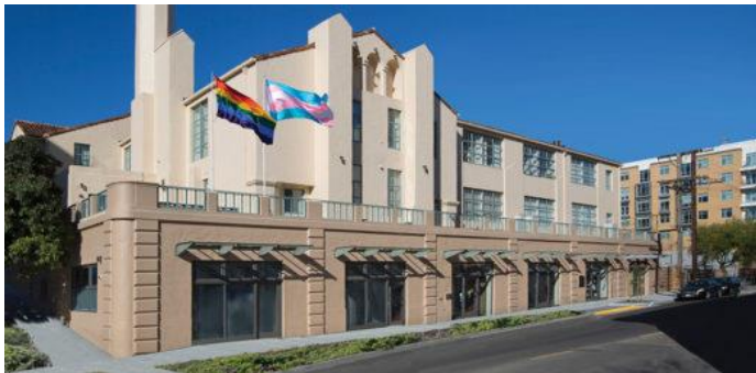
55 Laguna, District 8