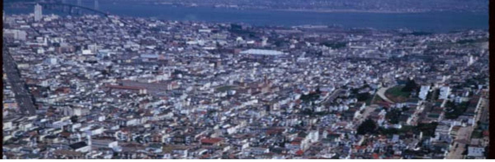
"The Mission from Twin Peaks."