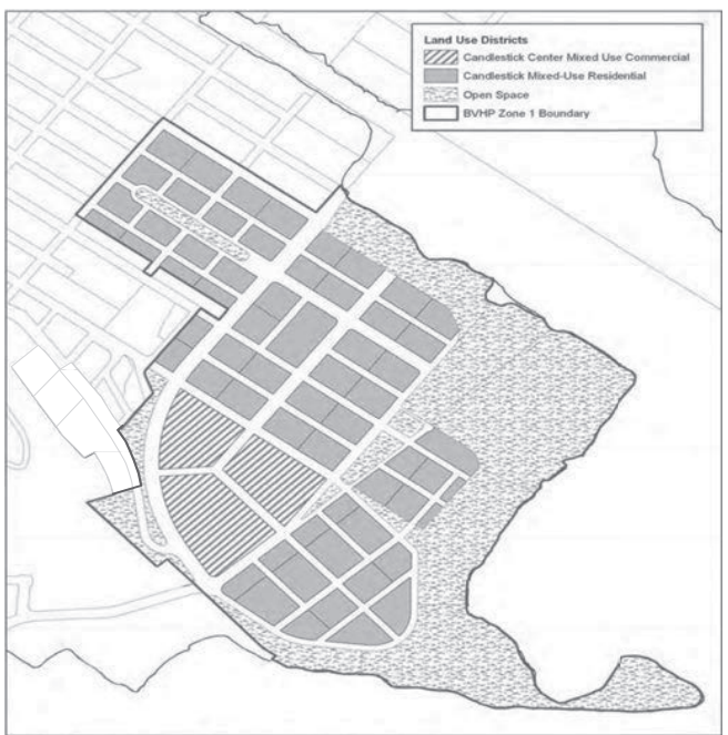
Map 4: Zone 1 Land Use Districts. Bayview Hunters Point Redevelopment Plan. Office of Community Investment and Infrastructure. 2018