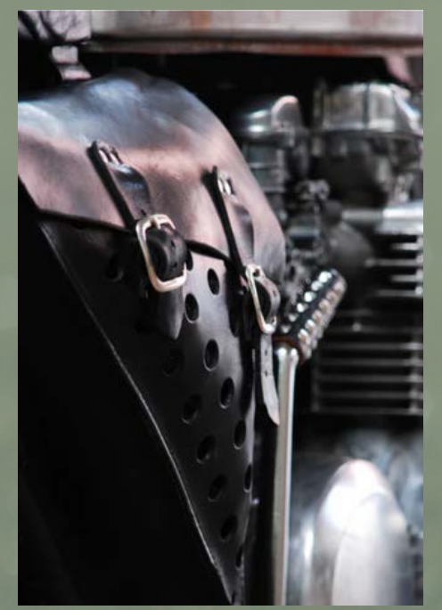
Skin on skins 3491 20th Street

Skin on Skins is a full custom leather shop with products and repair services. Created by Onder Keskin in 2002, who has been working with leather for over 30 years. Holiday deal: Buy one belt get one key fob for free,%20off all items till December 31st.